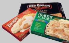
Frozen food boxes